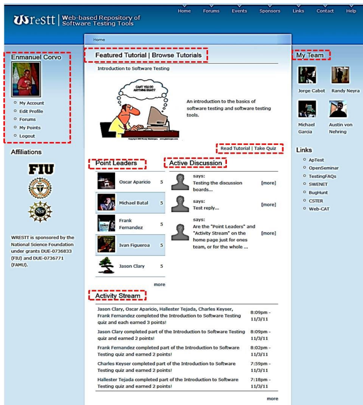
Fig. 2 Instructor view (left side) and the student view (right side)

Some of the main section of students' interface is highlighted in Figure 2. That is, each student can create profile , browse the testing tutorials , take quizzes , watch videos on the testing tools , interact with other students in the class via testing based discussions , and monitor the active discussions , activity stream and the virtual point leaders . In addition, depending upon the way an instructor wants to run their course, additional virtual bonus may be assigned for the team-based activities (e.g., all members have to complete a quiz to get team virtual points) to foster team collaboration using WReSTT.